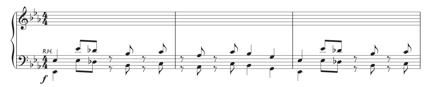
= 140 Moderate Latin beat

Words and Music by Doc Pomus and Mort Shuman